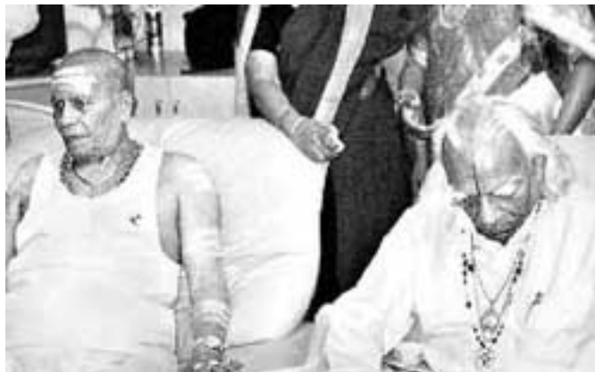
Sri K. Pattabhi Jois (left) with B.K.S. Iyengar July 26, 2005

Iyengar and Jois reportedly reminisced about their teacher Krishnamacharya, noted the ways in which the practice of yoga has changed over the past several decades, and expressed dismay at the fact that too many inexperienced people profess to be yoga teachers today.